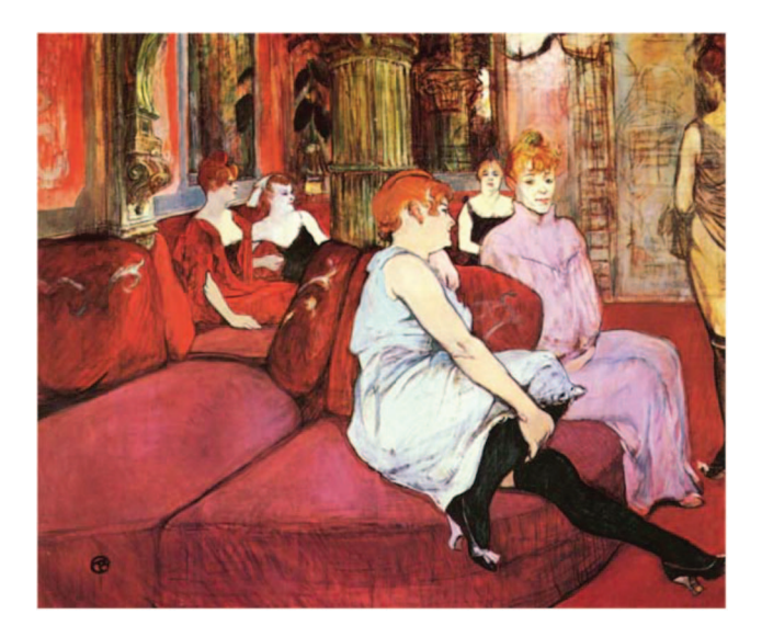
Figure 2. Le Salon de la Rue des Moulins (1894), Henri Toulouse-Lautrec.

which extended well into his 90s, from which to select for research. Some of his works of art are relatively simple, however, and therefore cannot elicit the highest level capabilities of aesthetic conceptual analysis.