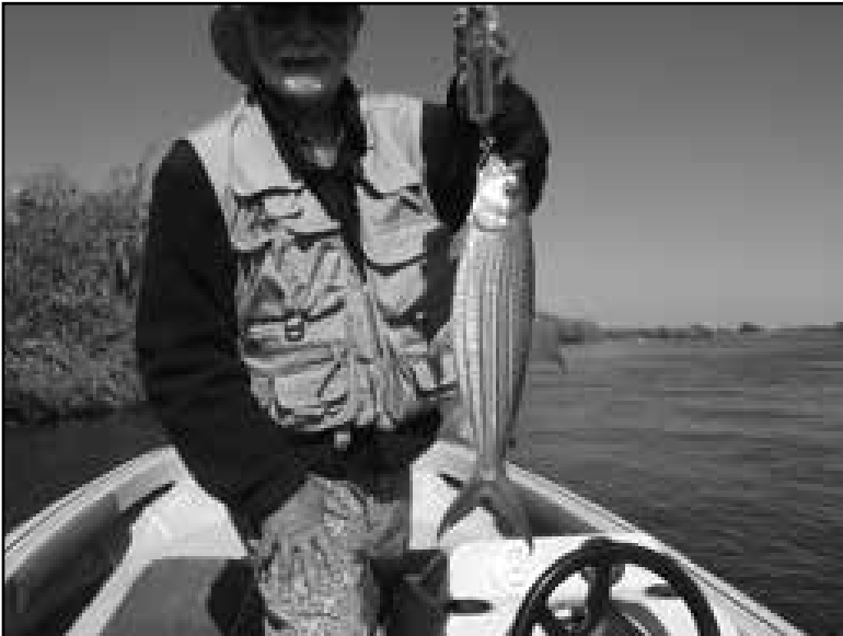
A smaller tiger.