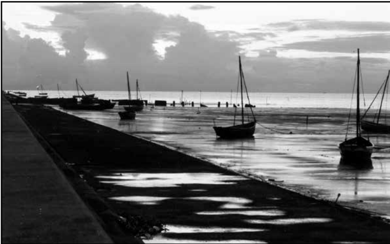
Boats in the mud seen from the seawall, Georgetown, Guyana.