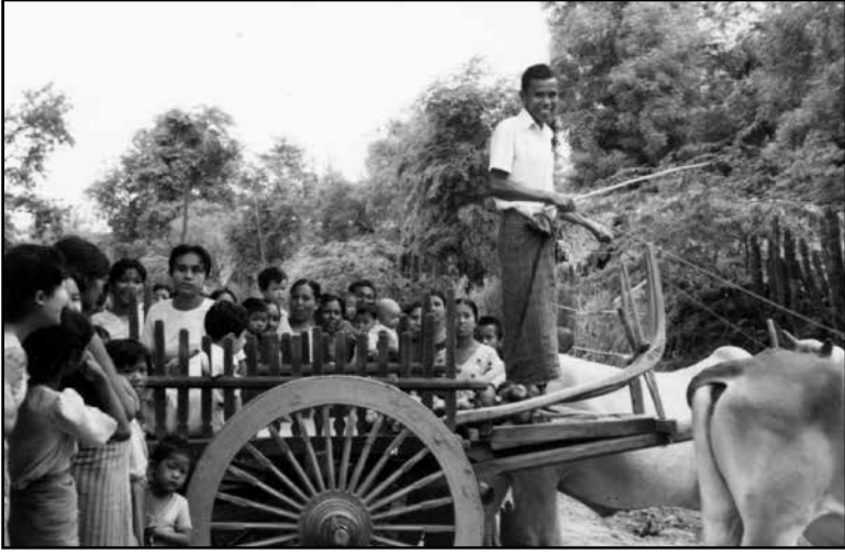
Transport in Pagan, North Burma.