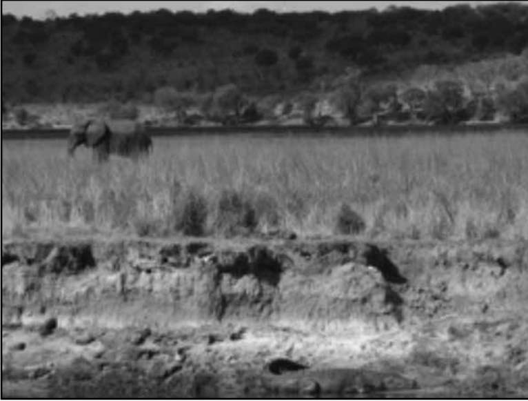
Elephant and crocodile on the Chobe's edge viewed from Ichizo.