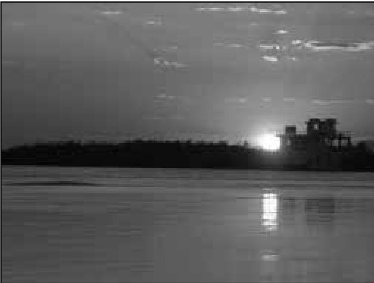
Houseboat at sunset.