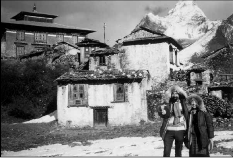
Tengboche Monastery, Christmas Day 1971, with Ama Dablam in background.