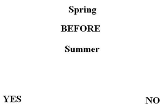
Figure 2. Example of a typical relational evaluation procedure trial-type.

For example, one such protocol is the SMART (Strengthening Mental Abilities with Relational Training) online protocol (Cassidy, Roche, & Hayes, 2011; Cassidy, Roche, Colbert, Stewart, & Grey, 2016; Hayes & Stewart, 2016). The SMART is essentially a systematically organized set of REP trials focused on the thoroughgoing assessment and training of core forms of relational framing. An early prototype of this online method was used by Cassidy, Roche, and Hayes (2011) to train both educationally typical and educationally disadvantaged children in core patterns of relational framing. The basic format involves the presentation of a relational network and a question as to the nature of the relation between two members of that network that could be answered by pressing either yes or no at the bottom of the screen. Results showed that months-long training at increasing levels of complexity in a number of frames including same, opposite, more